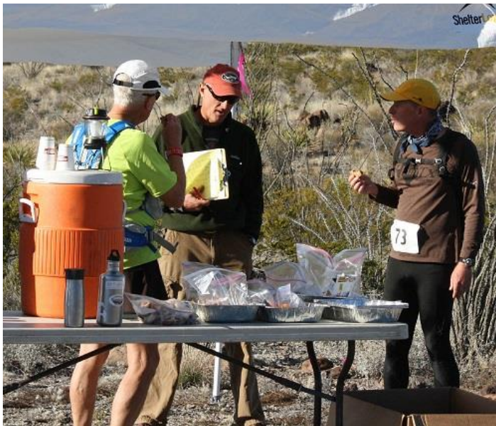
Water stop with volunteer and two runners – no, number 73 is not a ham!

Designing and setting up the repeaters for this race was just one part of the challenge. The aid station volunteers all had to face the same roads and terrain to reach their stations -- many of them camped at their station the night before and some even the night after the race.